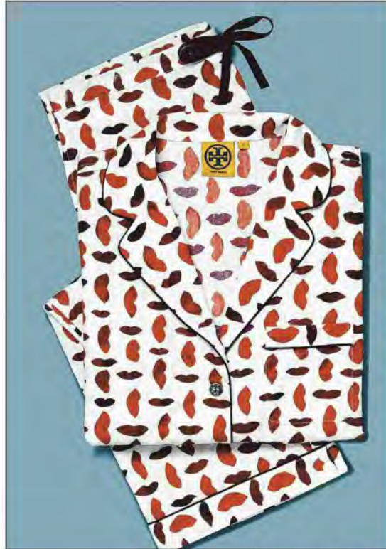
Tory Burch