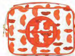
Tory Burch