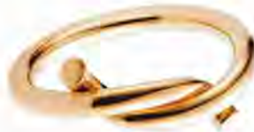
Cartier, Beverly Hills

This pink-gold ring is dainty yet substantial and totally stackable. $850 at Cartier, Beverly Hills.